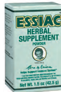
ESSIAC Powder Formula